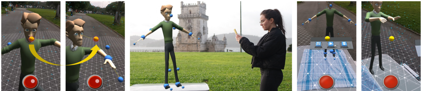
Figure 1: With AR-Pose a smartphone functions as a 3D cursor (yellow sphere) that selects and manipulates IK handles (blue spheres) for articulating the underlying rig of a humanoid character. Through a control panel placed in the workplace, a user can then define and save a sequence of poses to latter reproduce them as an animation.

Daniel Simões Lopes INESC ID Instituto Superior Técnico Lisboa, Portugal daniel.lopes@inesc-id.pt